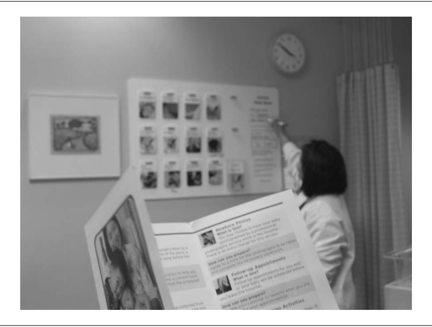
FIGURE 2: Postpartum Checklist